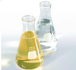
The Sparkle System transforms dirty, disease laden water into contaminant-free potable water.