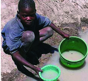
More than 1,000,000,000 people lack safe drinking water