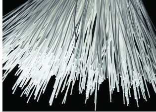
Hollow fiber membranes